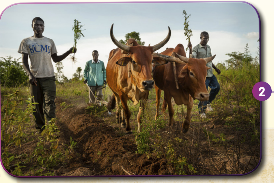
With the speed of ox ploughing the farmer can now take proper advantage of the rains by planting as soon as the rains arrive and also seeds can be planted at a deeper level. She can also till a larger area. The overall result is that crop yields per family are tripled or quadrupled.