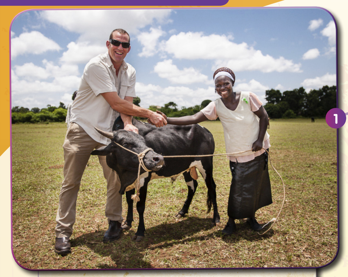
The story begins with a farmer receiving an ox. He shares a plough with his neighbours and now can plough an acre of land in a few hours instead of a back-breaking two weeks with a hoe.