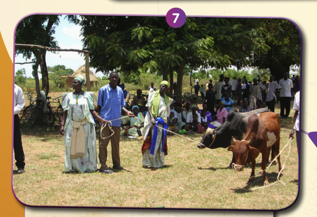
The sustainability of the project is ensured by the Passing on the Gift (POG) mechanism. After two years farmers who receive an ox have to finance the purchase of an ox for another farmer in their community.